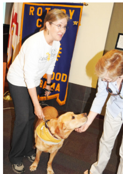
June 8, 2017 Meeting